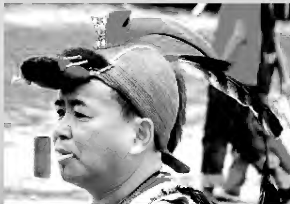
Nyishi tribesman wearing pudum with an artificial hornbill beak